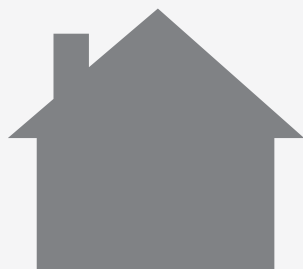
DISCHARGE TO HOME